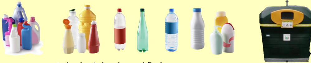
Only plastic bottles and flasks