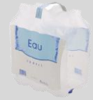
Plastic bags Cling Film